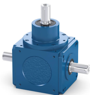
Spiral bevel gearboxes

For all applications where efficiency and reliability is required, the MECHANICAL product line offers powerful spiral bevel gearboxes and bevel helical gearboxes.